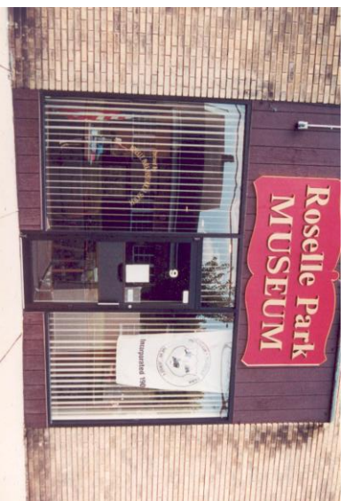
Roselle Park Museum