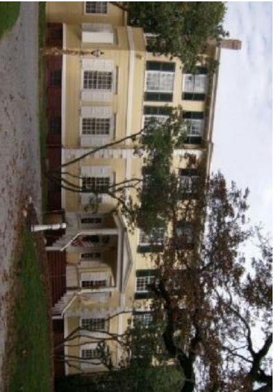
Liberty Hall Museum