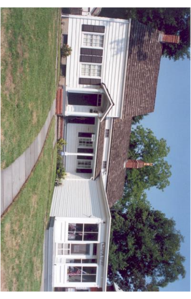
Woodruff House/ Eaton Store Museum