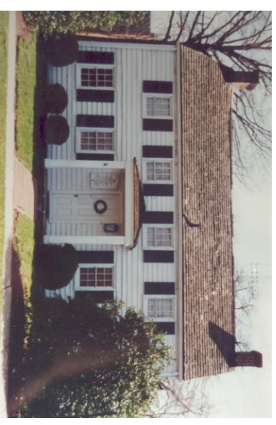
Osborn Cannonball House