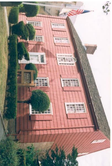
Boxwood Hall State Historic Site