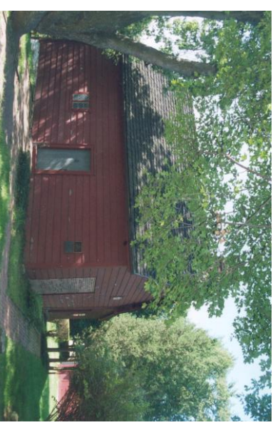
Dr. William Robinson Plantation