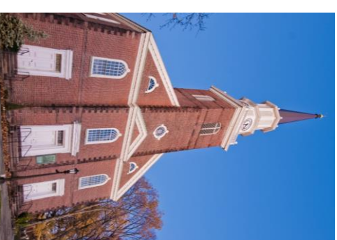
First Presbyterian Church of Elizabeth