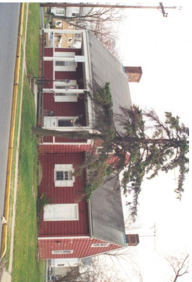
Abraham Clark House