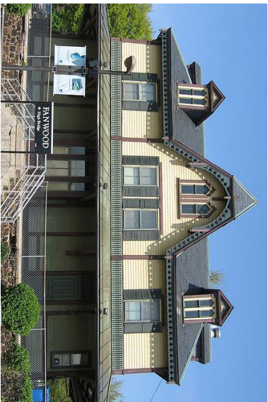
Historic Fanwood Train Station