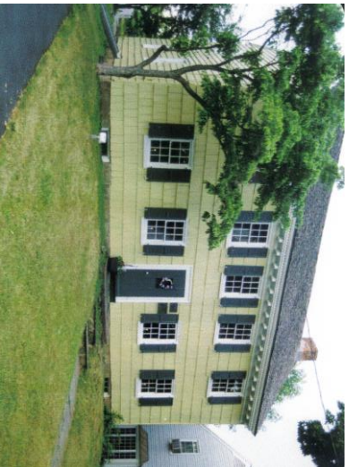
Cannon Ball House