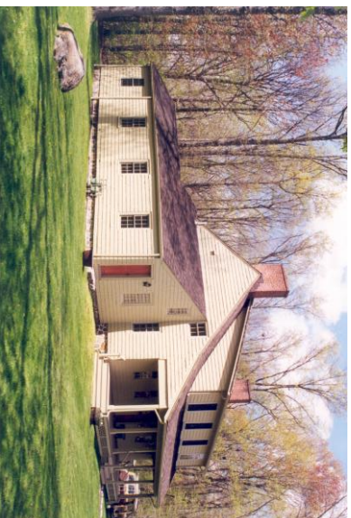
Crane-Phillips House Museum