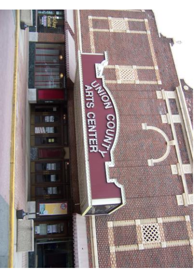
Union County Performing Arts Center