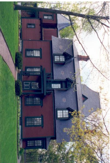
Drake House Museum