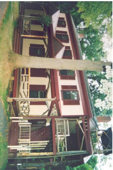
Deserted Village of Feltville-Glenside Park

Color Images are available at www.ucnj.org/4C