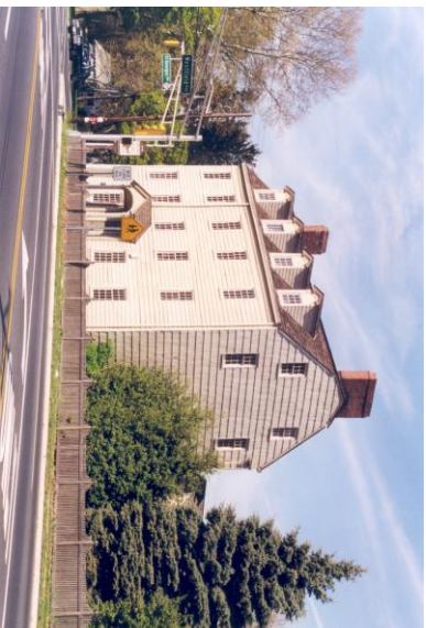
Merchants and Drivers Tavern