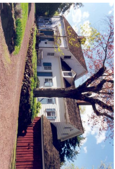
Miller-Cory House Museum