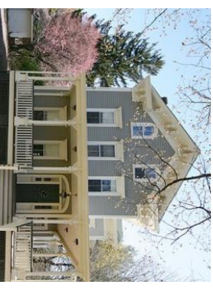
Reeve History & Cultural Resource Center