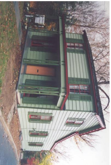
Crane-Philips House Museum